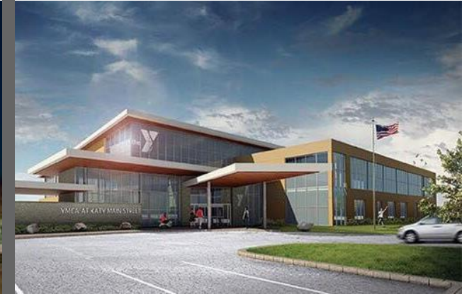
Mark A. Chapman YMCA at Katy Main Street