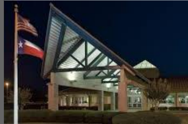
Monty Ballard YMCA at Cinco Ranch